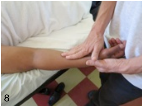
Forearm in 2 - 3 lines towards wrist