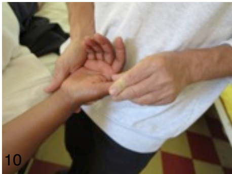
All the fingers