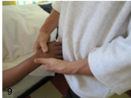
Upper and inner side of wrist